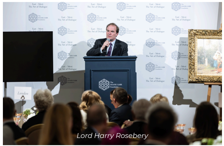
Lord Harry Rosebery