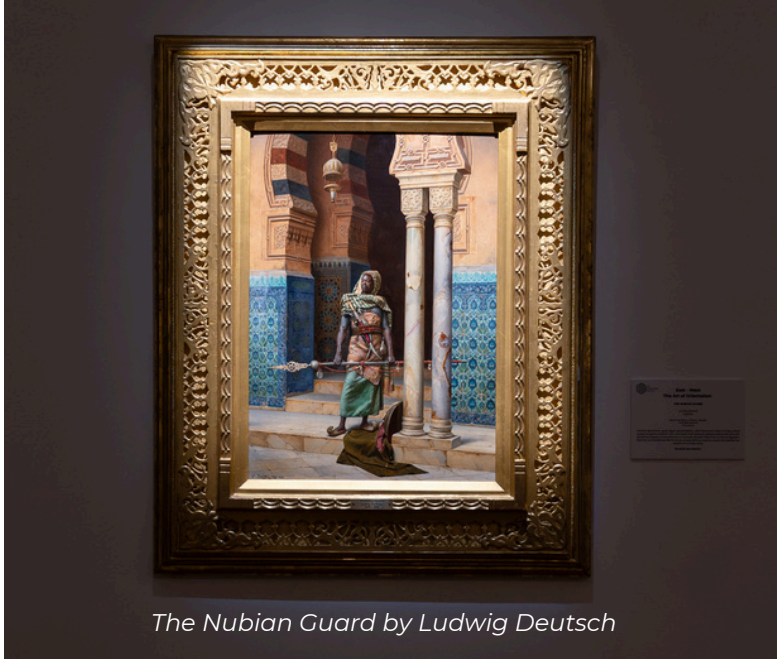
The Nubian Guard by Ludwig Deutsch