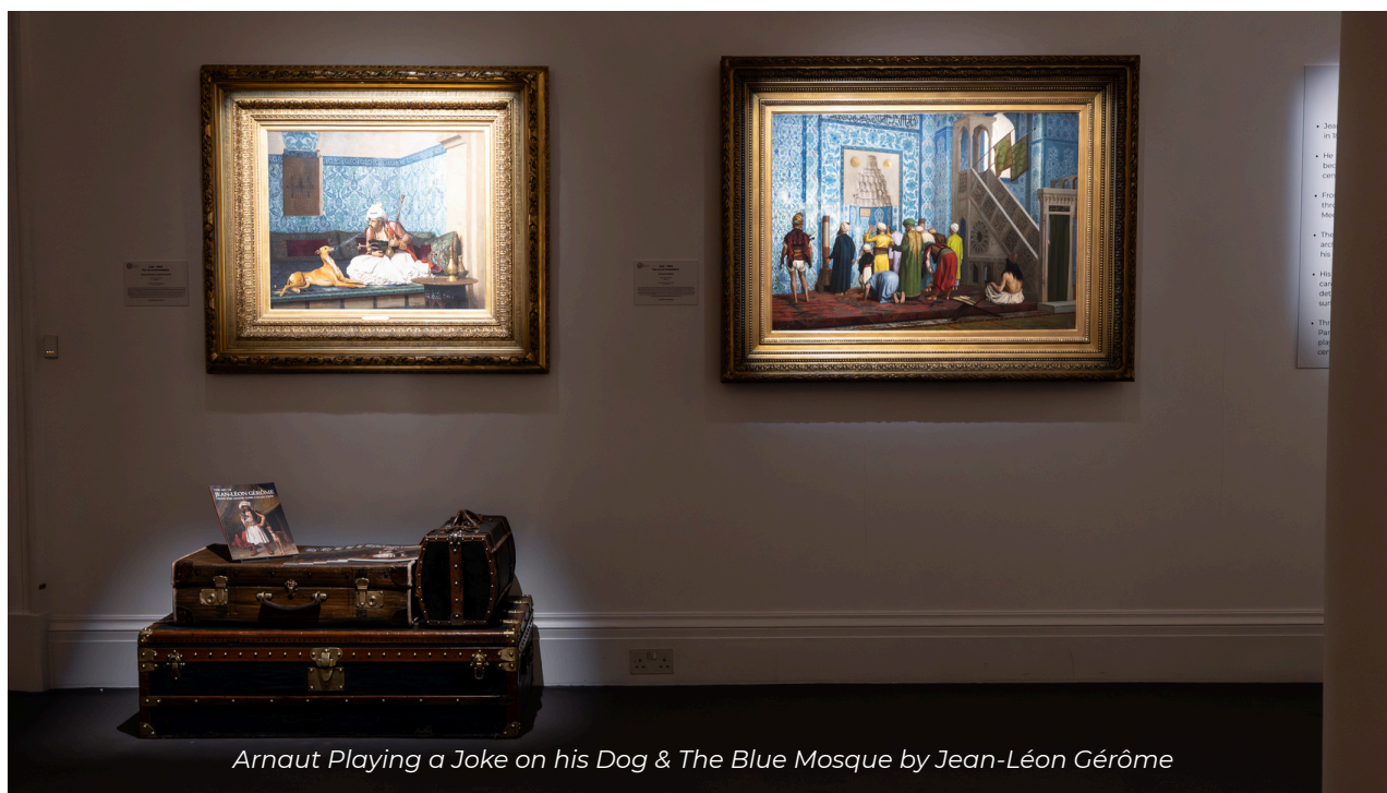
Arnaut Playing a Joke on his Dog & The Blue Mosque by Jean-Léon Gérôme