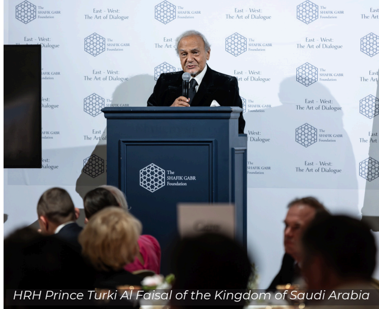
HRH Prince Turki Al Faisal of the Kingdom of Saudi Arabia

The dinner brought together an exceptional gathering of royals, diplomats, statesmen, business owners, scholars, and art historians. Distinguished guests included HRH Prince Turki Al Faisal of the Kingdom of Saudi Arabia; HSH Prince Philipp and HSH Princess Isabelle of Liechtenstein; ambassadors of Egypt, the United Arab Emirates, and the Kingdom of Jordan; and notable figures from the United Kingdom, including The Rt Hon. Tobias Ellwood and the Rt Hon. Kwasi Kwarteng.