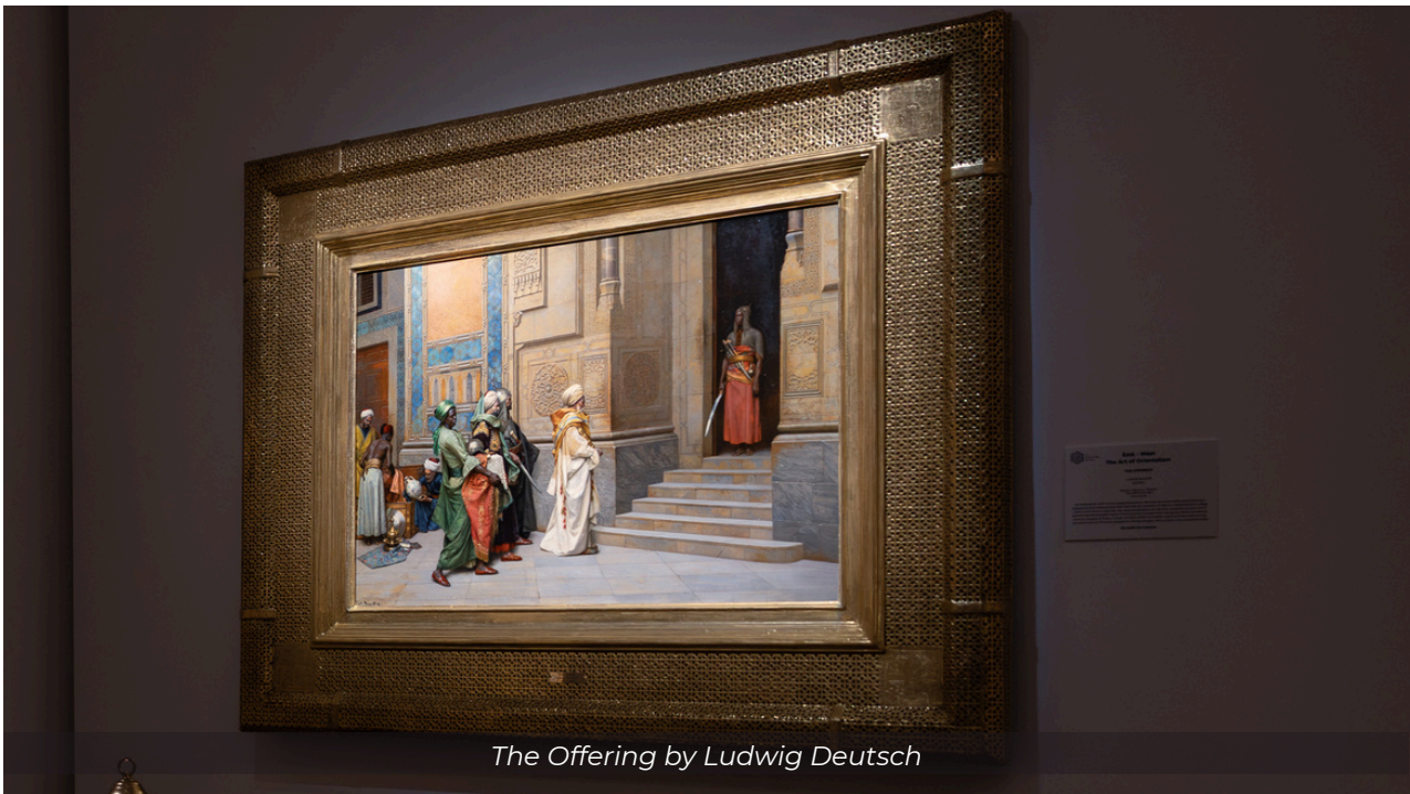
The Offering by Ludwig Deutsch