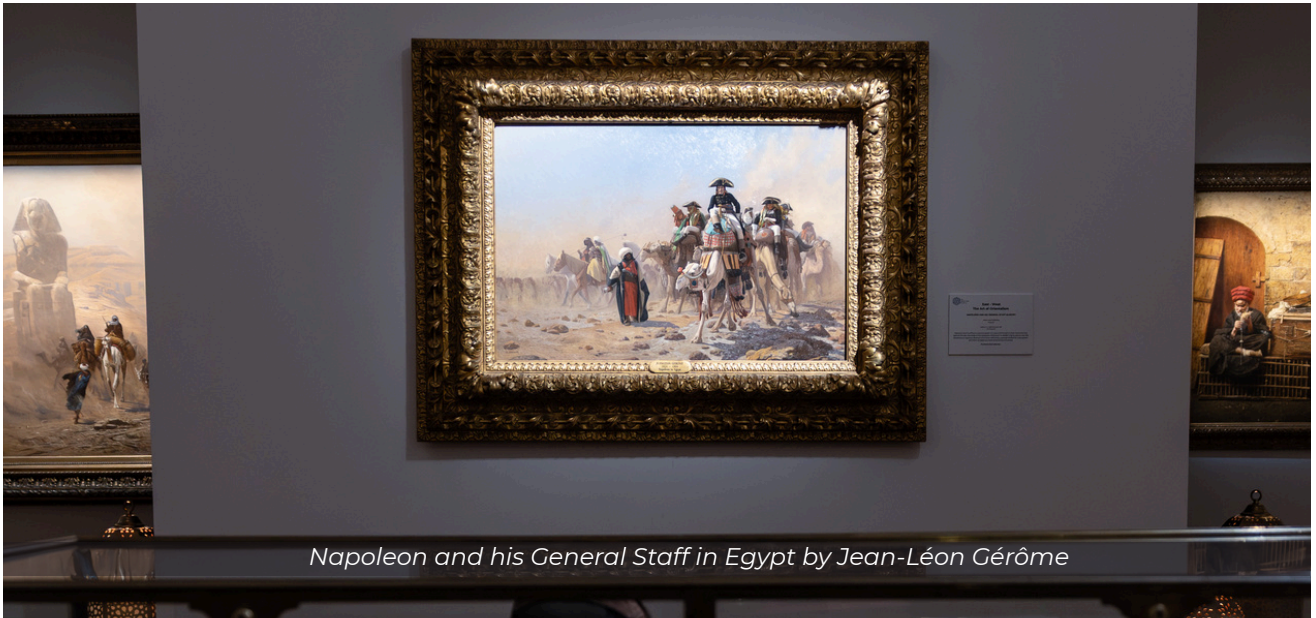
Napoleon and his General Staff in Egypt by Jean-Léon Gérôme