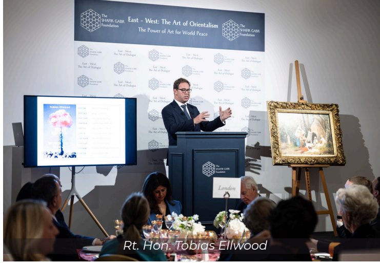
Rt. Hon. Tobias Ellwood