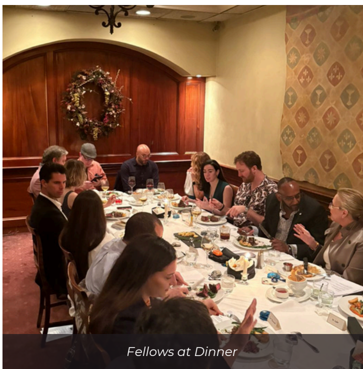
Fellows at Dinner

East-West: The Art of Dialogue is an initiative rooted in a single conviction, that dialogue is a bridge, and that it only takes one person to take an actual step. The Fellows Dinner of 17 May was proof of that conviction in action: a room of engaged, informed, and courageous people, willing to disagree, to listen, and to think beyond their own borders. The Foundation exists to create the conditions in which that step becomes possible.