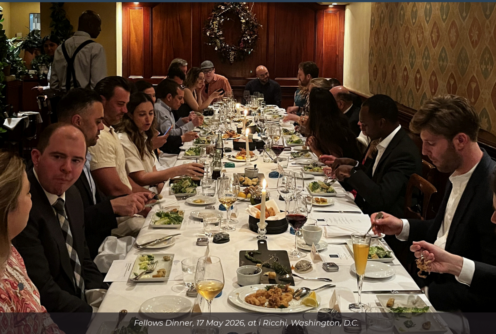
Fellows Dinner, 17 May 2026, at i Ricchi, Washington, D.C.

17 May 2026 · i Ricchi, Washington, D.C.